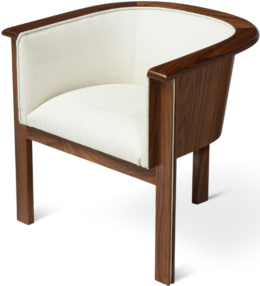
Cycle I Chair Model - 6501 | Designed 1965