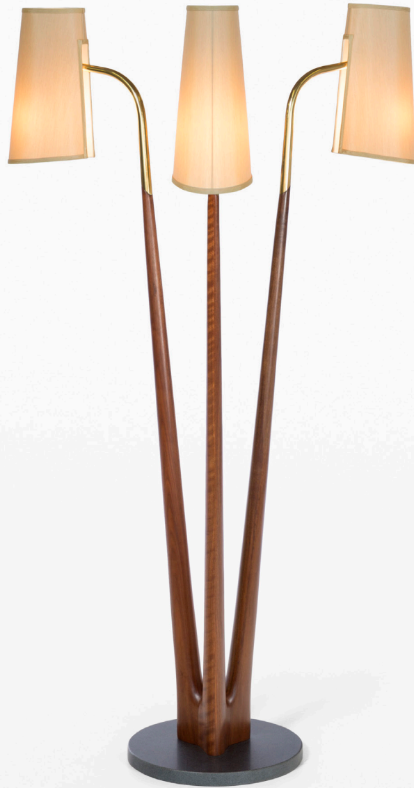
Swan Floor Lamp Model - 2050 | Designed 1957